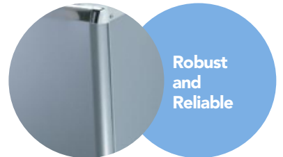
Robust and Reliable