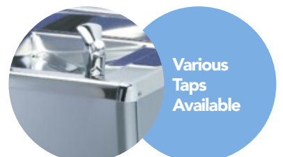
Various Taps Available