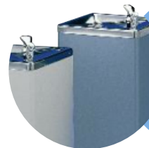
Robust and Reliable