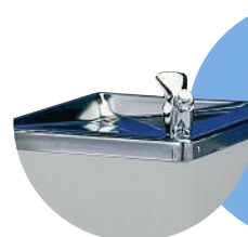
Various Taps Available