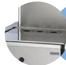
Adjustable Output Quantity