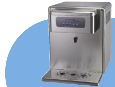
Tabletop Version Available