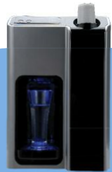
Countertop Version Available