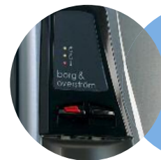
Choice of Water Options