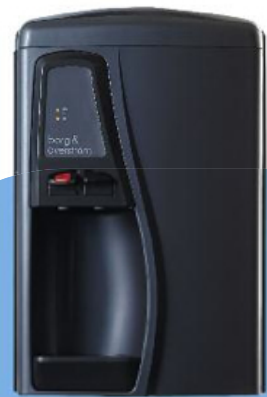
Countertop Version Available