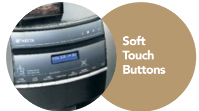
Soft Touch Buttons