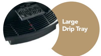
Large Drip Tray