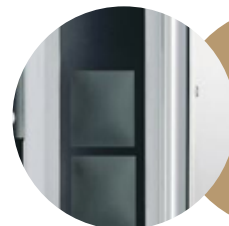
Smooth Wipe Free Services