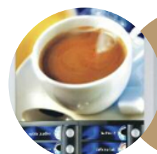
Back-lit Photographic Panels