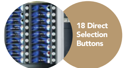
18 Direct Selection Buttons